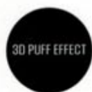
3D PUFF EFFECT