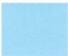
SKY BLUE 15