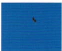
PACIFIC BLUE 08