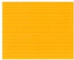
SUNNY YELLOW 03