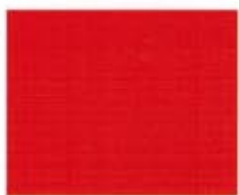
ELECTRIC RED 04