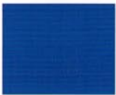
ROYAL BLUE 09