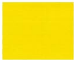
LEMON YELLOW 02