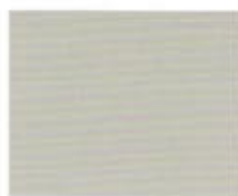
COOL GREY 11