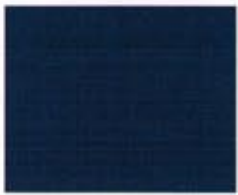
NAVY BLUE 07