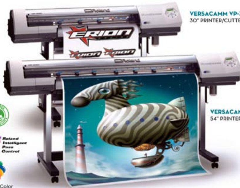
VERSACAMM VP-300i 30" PRINTER/CUTTER