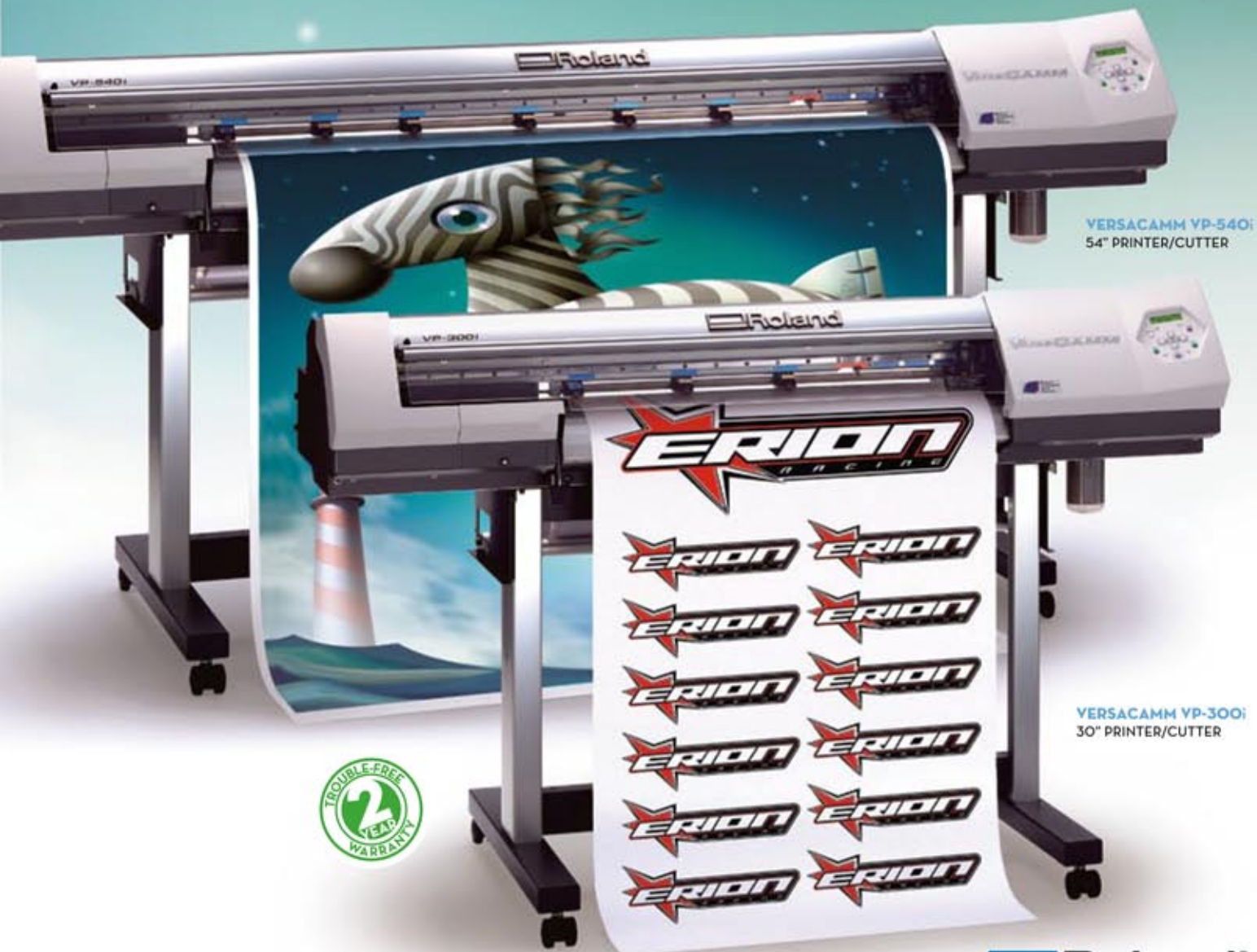
VERSACAMM VP-540i 54" PRINTER/CUTTER

You want to be ready for any job that comes in your door. The VersaCAMM VPi will keep you soaring above the competition.